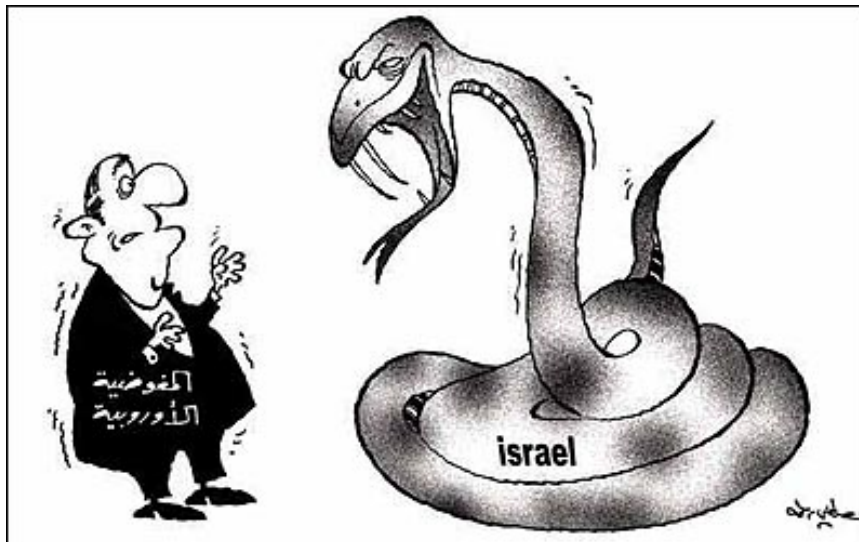
Al-Ittihad , November 7, 2003

Sharon (?) as a king, saying: "I am Israel, and Israel is me". The Jew on the left is applauding him.