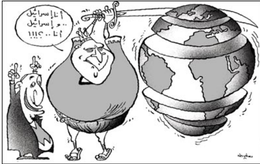
Al-Ittihad , November 18, 2003

Sharon (?) as a king, saying: "I am Israel, and Israel is me". The Jew on the left is applauding him.