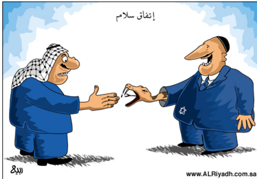
Ar-Riyadh , November 28, 2003