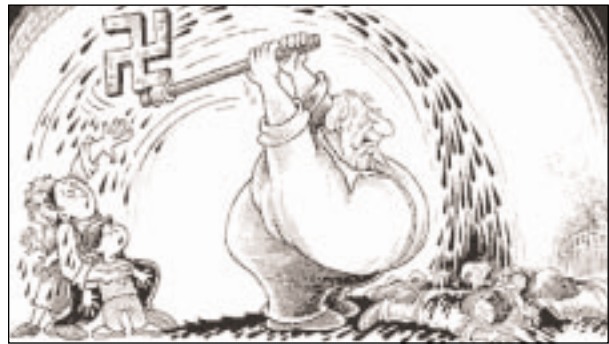
Cartoon printed in The Arab News , Saudi English language daily online version, April 10, 2002, which depicts Prime Minister Ariel Sharon wielding a swastika-shaped bludgeon against Palestinian children.

“Whenever the murderer Sharon kills a Palestinian pure human being, the Palestinian response is faster than what he imagines...”