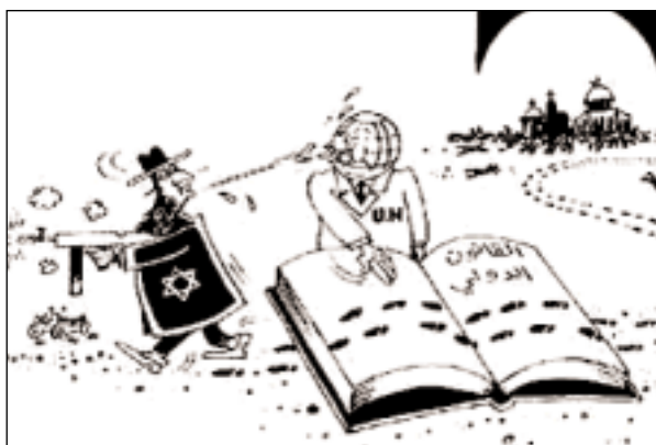
Cartoon in Tishrin , Syrian newspaper, May 8, 2002 depicting a stereotypical Jew spitting at a United Nations representative as he is reading the international laws.

_____ All translations by ADL unless otherwise indicated.