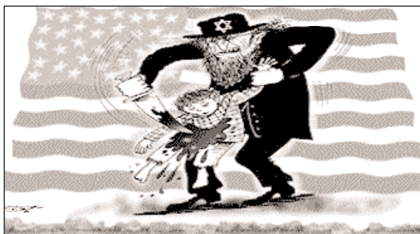
Cartoon in Al-Watan , Qatari newspaper, March 17, 2002, which depicts a stereotypical bearded Jew murdering a Palestinian child.