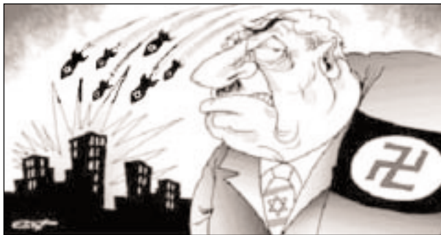
Cartoon in Al-Watan , Qatari newspaper, March 14, 2002, which depicts Prime Minister Ariel Sharon with a swastika armband.

ing to bring him much blood and fire drinking glasses. Sharon does not weaken or strengthen. He governs and is governed by the American media and the stock exchange.”