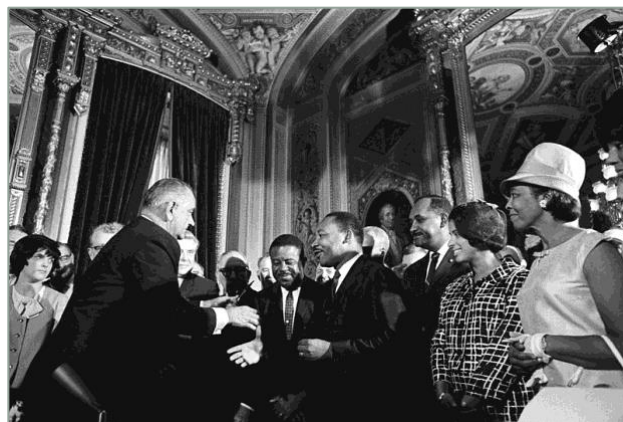
President Johnson and Martin Luther King, Jr. at the signing of the Voting Rights Act on August 6, 1965.

He—and we—did overcome. On August 6, 1965, President Johnson signed into law the Voting Rights Act, hailed by many as the most effective civil rights law ever.