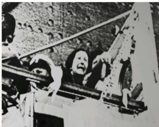
A woman cries as the St. Louis pulls away from Havana, 1939. | Keystone-France via Getty Images

Source: "Map Showing the Voyage of the St. Louis, May 13-June 17, 1939.", American Jewish Joint Distribution Committee Archives, "The Story of the S.S. St. Louis (1939)"; http://archives.jdc.org/educators/topic-guides/the-story-of-the-ss-st.html (Last visited February 5, 2017).