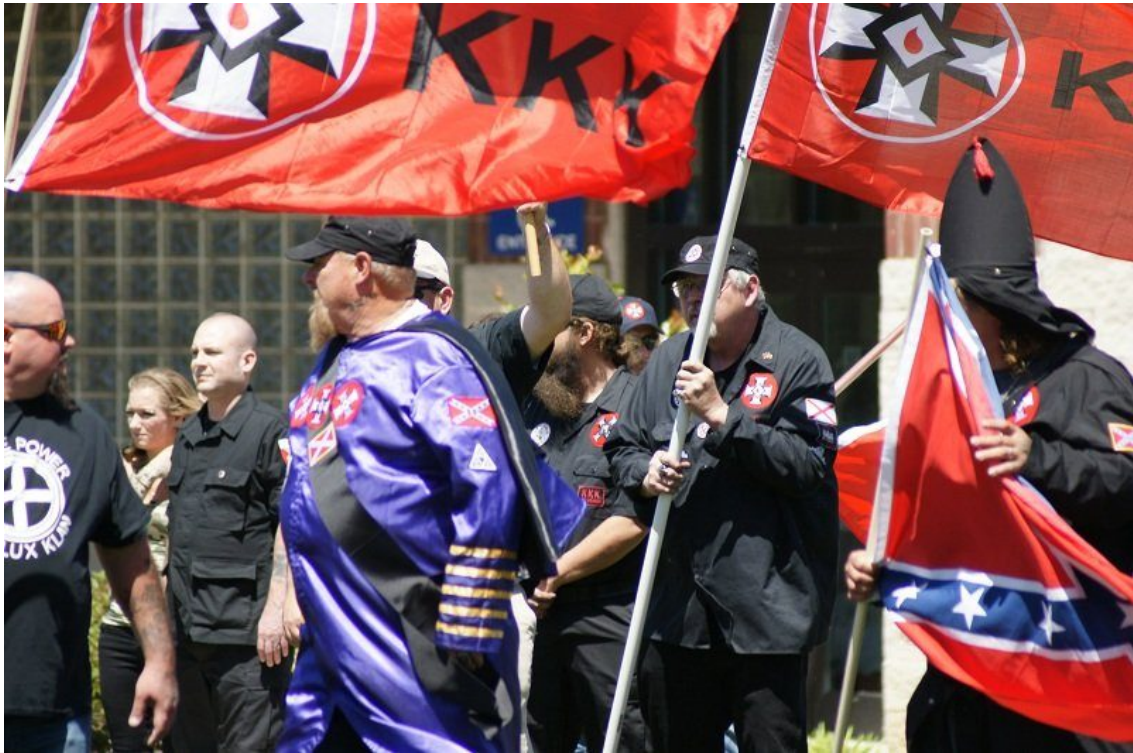
Klan members stand in front of the Law Enforcement Center in Rome, Georgia, April 2016

Five months later, on November 5, the NSM held its Fall rally on the steps of Pennsylvania's capitol building in Harrisburg, this time drawing approximately 15 associates of the White Knights of the KKK of America and Texas Rebel Knights.