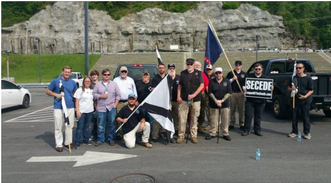
LoS members and supporters gather for rally in Pikeville, Kentucky