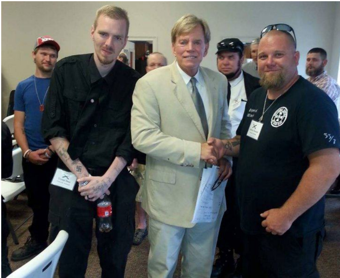
David Duke and members of the Global Crusader Knights attend LoS conference