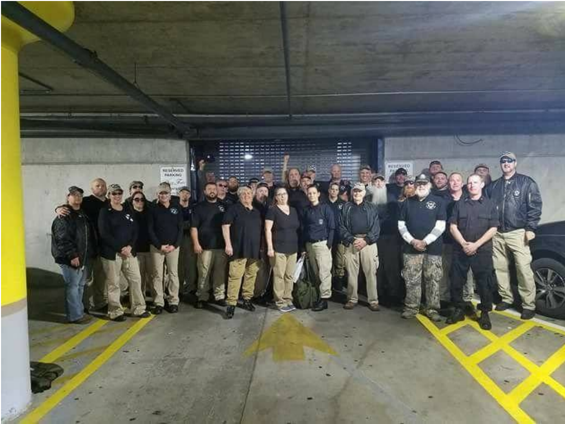
LoS members and supporters gather in parking in Tallahassee, Florida