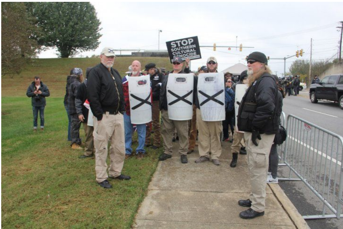
LoS member at the "White Lives Matter" rally in Shelbyville