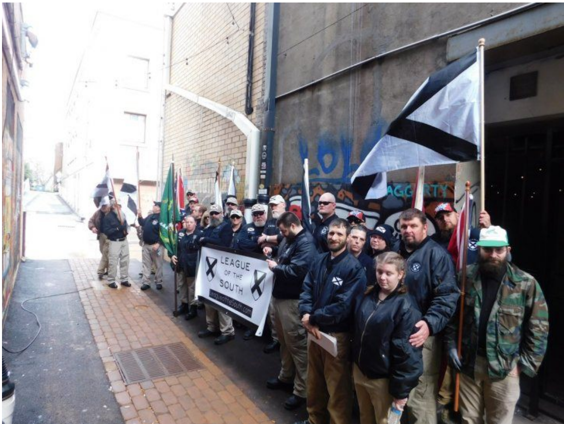
LoS members assemble in Knoxville, Tennessee