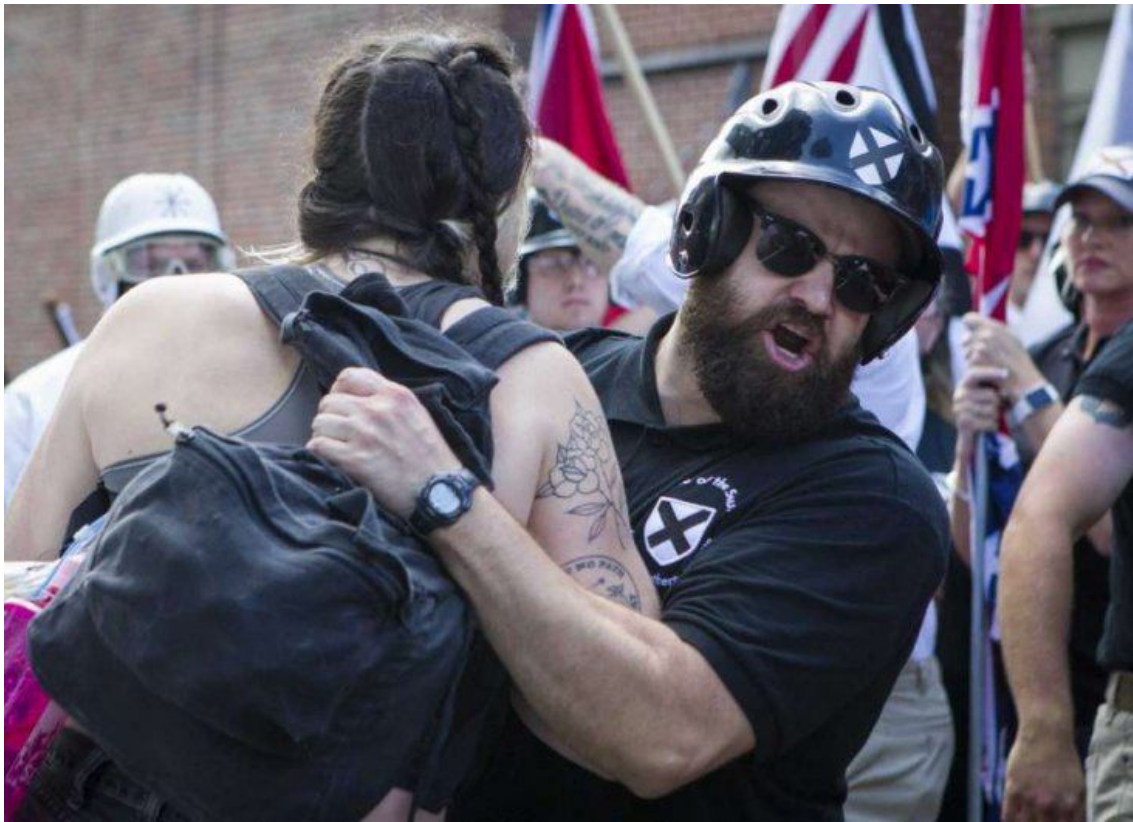
LoS member at the Unite the Right rally in Charlottesville, Virginia