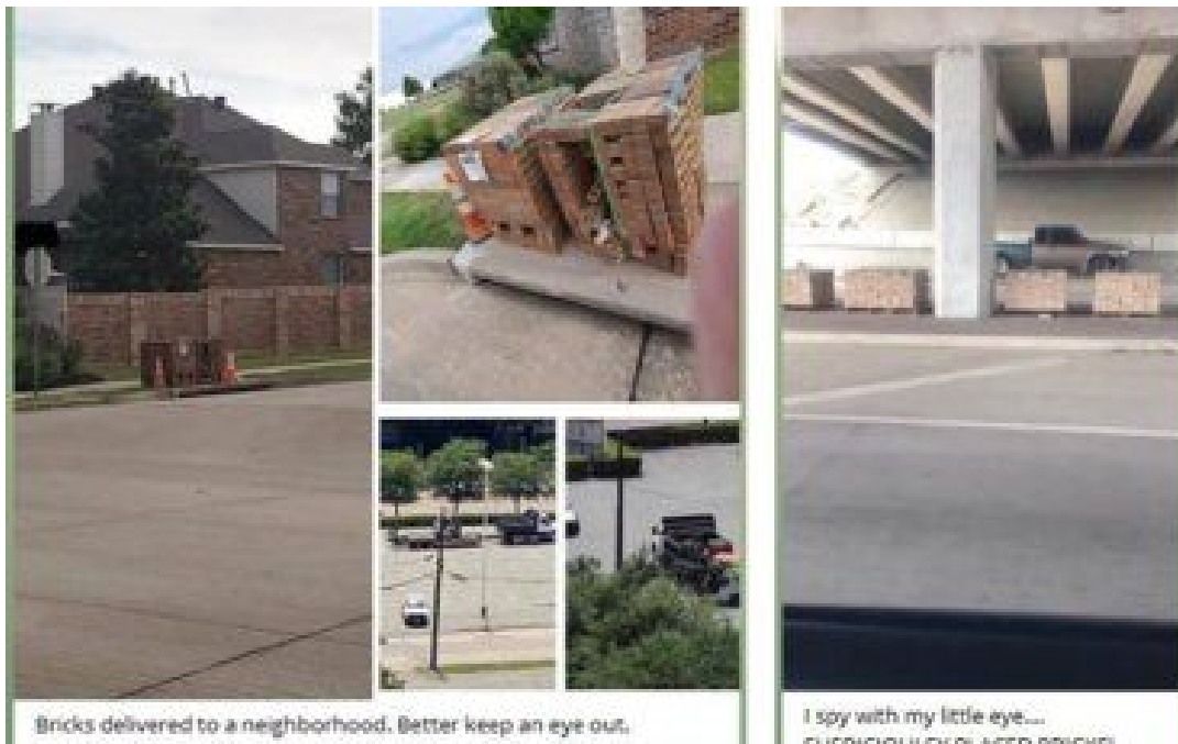
Bricks delivered to a neighborhood. Better keep an eye out.