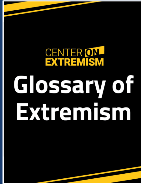
Glossary Of Extremism