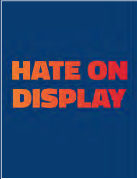
Hate on Display™ Hate Symbols Database