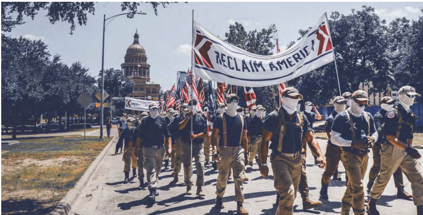
Members of the white supremacist group Patriot Front marched in Austin on July 8, 2023.

The group frequently uses red, white and blue colors in its propaganda and has commonly avoided using traditional white supremacist language and symbols in its messaging, instead using ambiguous phrasing like “For the Nation Against the State,” “Reclaim America” and “America First.” However, in December 2022, they began reincorporating antisemitic and white supremacist phrases into their propaganda, and in the first six months of 2023, ADL found that Patriot Front distributed antisemitic propaganda six times in Texas that read: “No Zionists in government, we serve one Nation.”