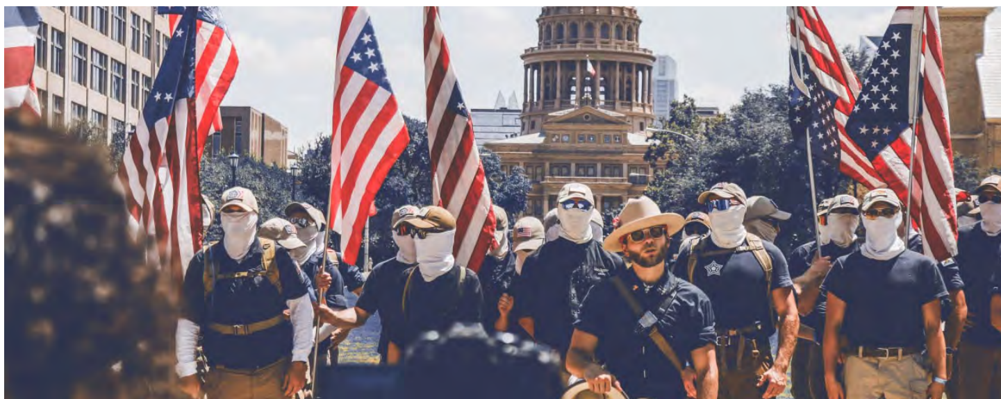
Members of the white supremacist group Patriot Front marched in Austin on July 8, 2023. (Telegram)