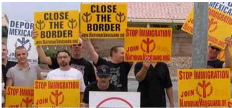
Members of the neo-Nazi National Vanguard target Mexican immigrants at a rally in Las Vegas

The vigilante border patrol groups have operated for several years but have expanded greatly in the past twelve months, spurred on by the media attention given to the so-