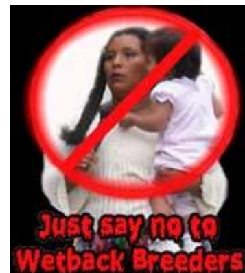
This racist, anti-Hispanic image was posted on the Web site of the Northwest unit of the neo-Nazi National Socialist Movement

While white supremacists have for many years attempted to exploit rising anti-