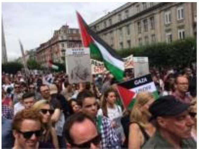
Dublin, Ireland July 12

In Dublin, Prime Minister Netanyahu is depicted as Hitler on a sign, "Wanted: Zio Nazi".