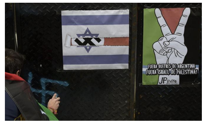
Buenos Aires, Argentina July 8