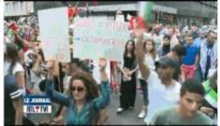
Brussels, Belgium July 18 - Source: rtl.be

In Brussels a woman held up "Israel=Hitler" signs.