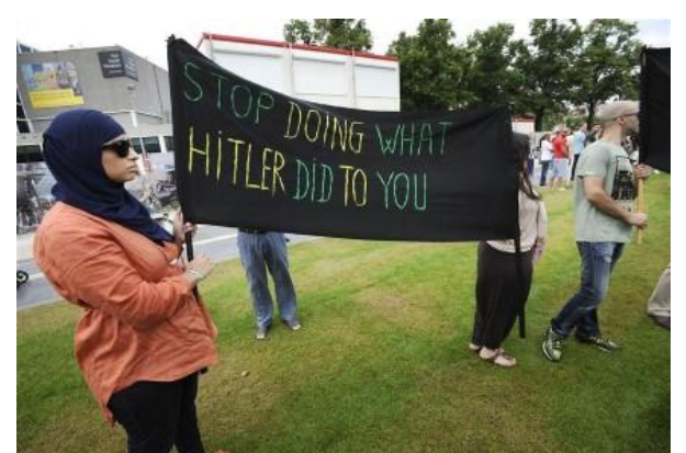
Amsterdam, Holland August 3

On July 20 in Amsterdam, one protester took demonization quite literally: "Stop Sionist [sic] Demons in Gaza."