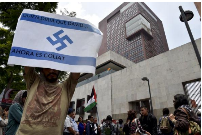
Mexico City, Mexico July 11

Santiago, Chile July 12