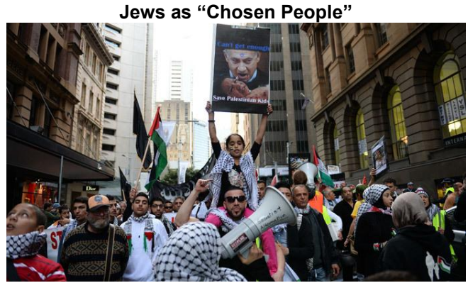
Sydney, Australia August 3

Santiago, Chile August 2