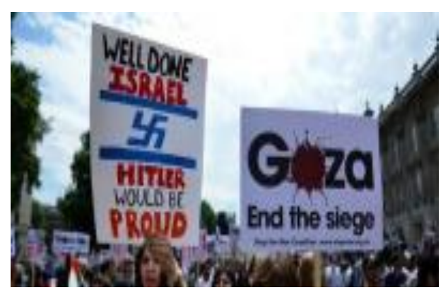
London, UK July 19 - Source: Carl Court/AFP/Getty Images

A sign reading "Well Done Israel, Hitler would be Proud" was held up during a London protest.