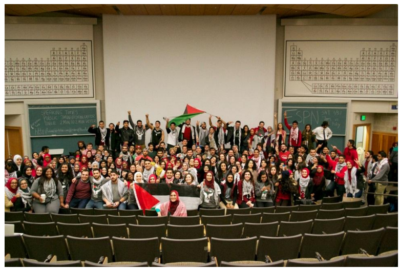
Students at the University of California-Davis after a BDS resolution was passed (January 2015)

In addition to organizing anti-Israel programs, student groups also initiated 29 BDS campaigns on U.S. campuses in 2014-15, a 21% increase from the 15 BDS campaigns in the previous academic year. Student governments or student bodies actually voted on and sometimes debated 19 of the 29 campaigns. From those 19 votes, there were ten campaigns that received endorsement from either their student government or student body, compared to five from the previous year, marking a 100% increase in the number of BDS campaigns that received endorsement.