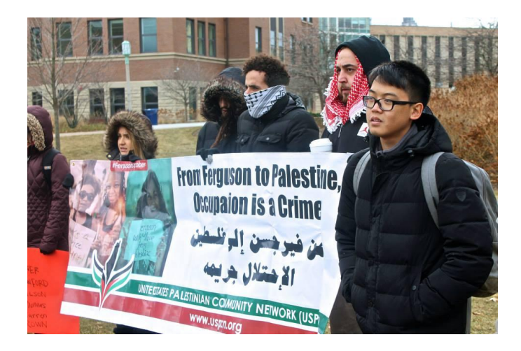
Pro-BDS Protesters at Loyola University (December, 2014)

This trend of connecting Israel to issues of police brutality in the U.S. continued throughout the school year, as students continued to link problems in cities such as Baltimore and New York City to Tel-Aviv and the West Bank. Anti-Israel groups and individuals went about this through sponsoring panel discussions on the topic, writing articles in campus newspapers, and by holding signs and leading chants at anti-Israel rallies.