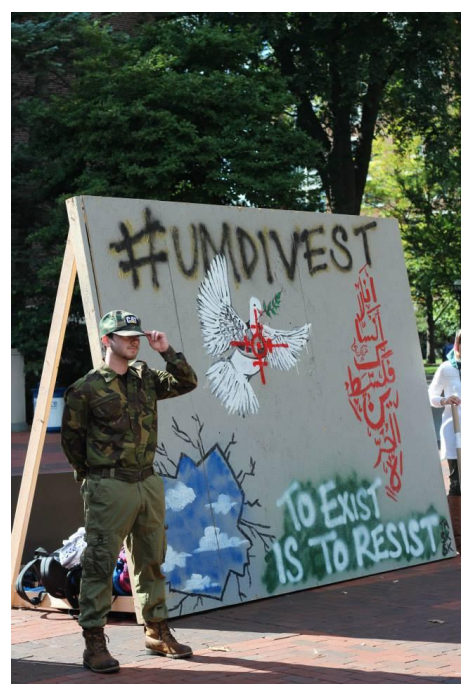
A mock checkpoint promoting BDS, setup during Palestine Awareness Week at University of Michigan (October 2014)

On other campuses, many student groups also organized programs that effectively worked to demonize and delegitimize Israel and Zionism, while promoting BDS campaigns as just and non-violent solutions to the problems at hand. Examples of these programs included guest speakers who promoted false allegations about Israeli apartheid and racism; rallies and protests that decried alleged Israeli human rights violations such as ethnic cleansing, and in some cases weeklong programs such as Israeli Apartheid Week, Anti-Zionism Week, or Palestine Awareness Week, which continued to wane in popularity, but took place on dozens of campuses last year.