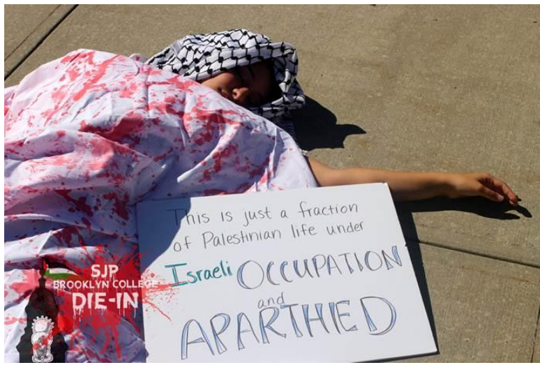
A student at the Brooklyn College "Die-in" (October 2015)

Also, since the beginning of 2014, many student groups have also organized events which couched hostility towards Israel in social justice terms and linked the Israeli-Palestinian conflict to other causes such as the BlackLivesMatter movement. These sorts of events were quite common last year and anti-Israel student groups received increased support from other minority student-groups on many campuses. It appears that this trend is continuing this year.