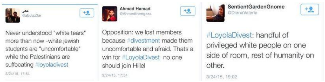
Tweets from pro-BDS students during and after the student government BDS vote at Loyola University.

with the same sentiment and wrote "Never understood 'white tears' more than now – white jewish [sic] students are 'uncomfortable' while the Palestinians are suffocating," and lastly, another student celebrated that the campus Hillel was allegedly losing members, claiming that "#divestment made them uncomfortable and afraid" and that, "That's a win for #LovolaDivest no one should join Hillel."