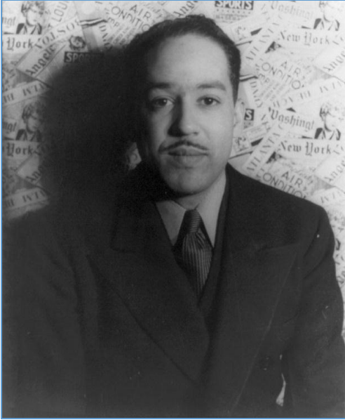
Langston Hughes, February 29, 1936