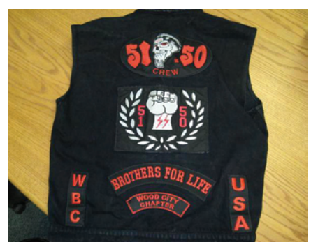
5150 Crew colors back