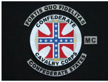
Confederate Cavalry Corps MC Colors

Formed in 2009, the small Alabama-based Confederate Cavalry Corps MC (CCC MC) claims members in Missouri and Mississippi, but the bulk of the membership is from small Alabama towns such as Millbrook, Eclectic, Wetumpka, Theodore, and Troy. Touted by members as the "premier Confederate heritage motorcycle club", this