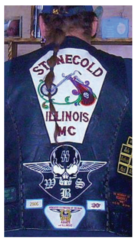
Stonecold MC member wearing one variant of the WBS patch

Created in April 2006, the Illinois-based White Boy Society (WBS) is a loosely organized white supremacist biker group. The WBS Web site explains that they are a group of "white brothers" who ride with the "14 words" as their only agenda, adding that "we are a two wheeled nomadic tribe of White Separatists that believe in showing pride in our race, heritage and the accomplishments of our ancestor's [sic]."