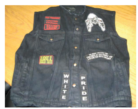
5150 Crew colors front

The gang's club colors include the phrase "White Pride" and a reference to the "14 Words," as well as an Aryan Fist symbol with SS runes on the wrist. The 5150 Crew refers to Phoenix as the "White Boy City" and members wear a WBC patch is worn on the back of the colors as a reference to their turf.