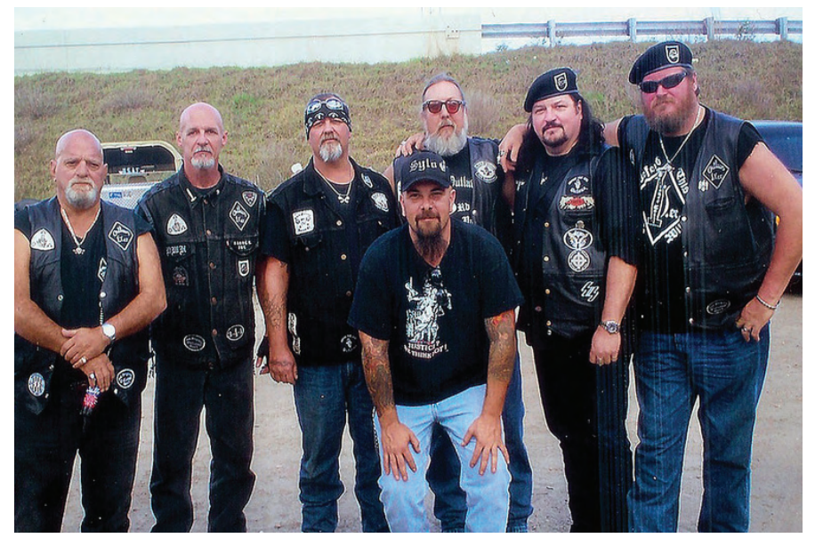
Kavallerie Brigade members and supporters

The Florida Kavallerie Brigade has close ties to the Florida Chapter of the Outlaws MC. A number of Outlaw members wear the Kavallerie Brigade flash on their colors or berets. The Kavallerie flash resembles the 5th Army