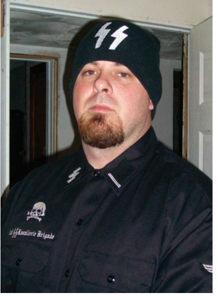
1st Kavallerie brigade uniform