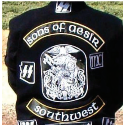
Sons of Aesír Colors

The Arizona-based Sons of Aesír (SOA) is a white supremacist outlaw biker club created in 2005. Relatively small, it currently has several dozen members, the bulk of whom are middle-aged men who live in the Phoenix area. SOA members have jobs ranging from tattoo artist to pipe layer to tow truck driver. A number of SOA members have extensive criminal histories, including charges related to racketeering, explosives, weapons violations and aggravated assault.