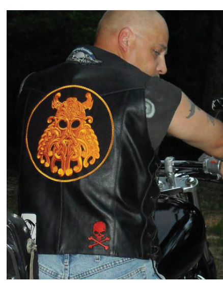
White Riders Riding Club Colors

member of WBS, is a member of the True Invisible Empire Traditionalist Knights of the Ku Klux Klan, a Christian Identity Klan based out of Tennessee.