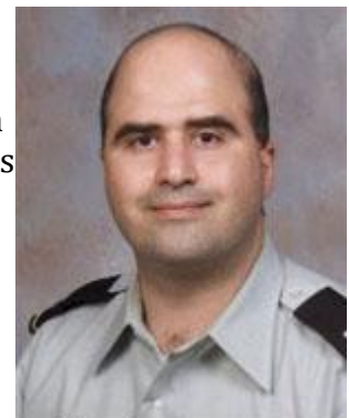
Nidal Malik Hasan

Nidal Malik Hasan , an Army psychiatrist from Virginia who allegedly killed 13 people and wounded more than 30 others at the Fort Hood Army base in Texas, expressed his support of killing Jews and Israelis in a series of e-mails exchanged with American Muslim cleric Anwar al-Awlaki prior to the attack. Hasan also mentioned various justifications for "targeting the Jews with rockets" in e-mails sent to al-Awlaki, the American-born Muslim cleric living in Yemen who distributes radical online lectures encouraging American Muslims to attack non-Muslims and Western interests.