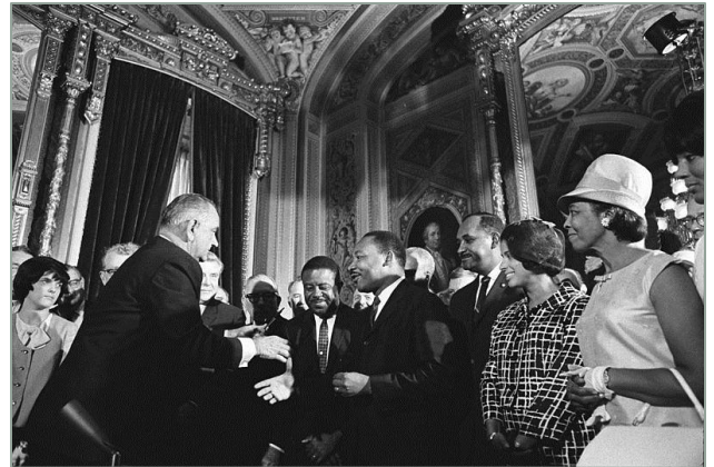
President Johnson and Martin Luther King, Jr. at the signing of the Voting Rights Act on August 6, 1965.

He—and we—did overcome. On August 6, 1965, President Johnson signed into law the Voting Rights Act, hailed by many as the most effective civil rights law ever.