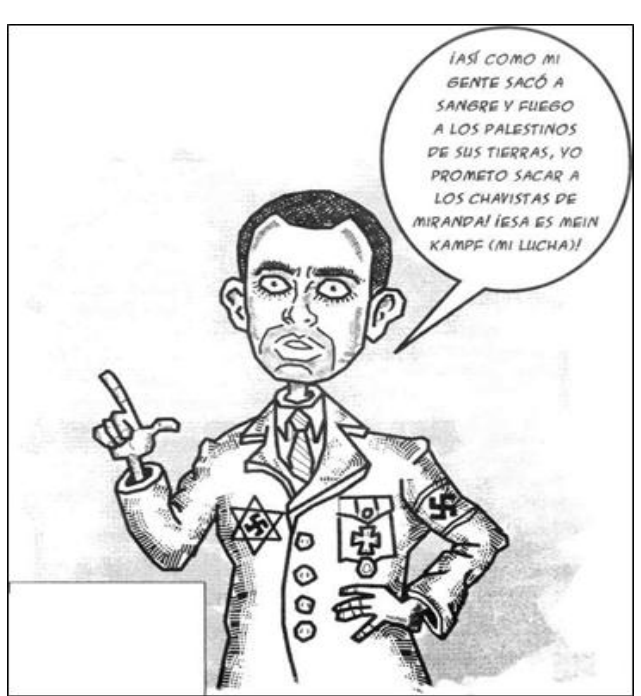
Cartoon when Capriles was Governor of Miranda The same way that my people pushed out with blood and fire the Palestinians of their lands, I promise to push out the Chavistas from Miranda. That is Mein Kampf. (My struggle) La Hojilla Impresa, Venezolana de Television December 2008